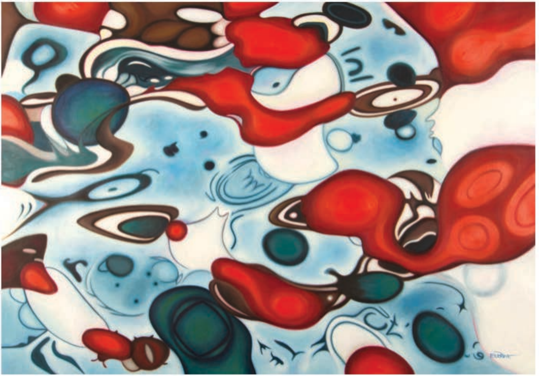
Danielle Eubank Ny Alesund III Oil on linen 28×40 inches 2016