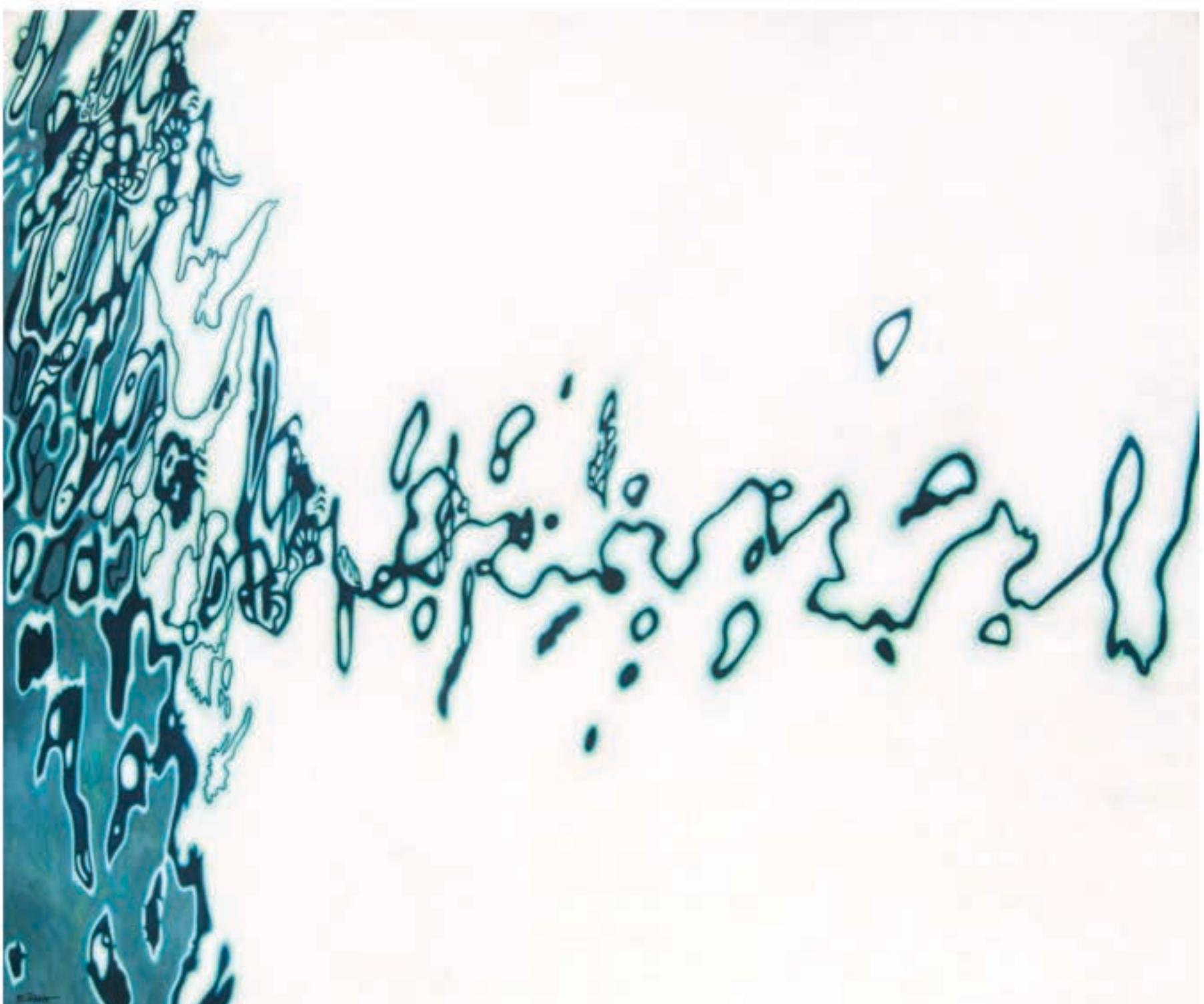
Danielle Eubank Arctic XI Oil on linen 60x72 inches 2018