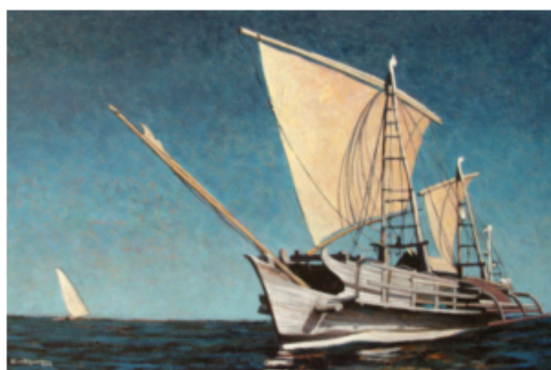
Borobudur Ship IV