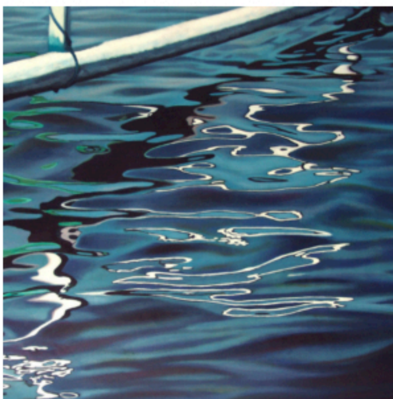
Padang Bai I Oil on linen 30x30 inches 2005

"Painting all of the Earth's oceans is about showing, through art, that the oceans sustain us – literally and, for me, artistically," says Eubank. "There is a unifying preciousness amongst these bodies of water – and the people and animals that rely on them."