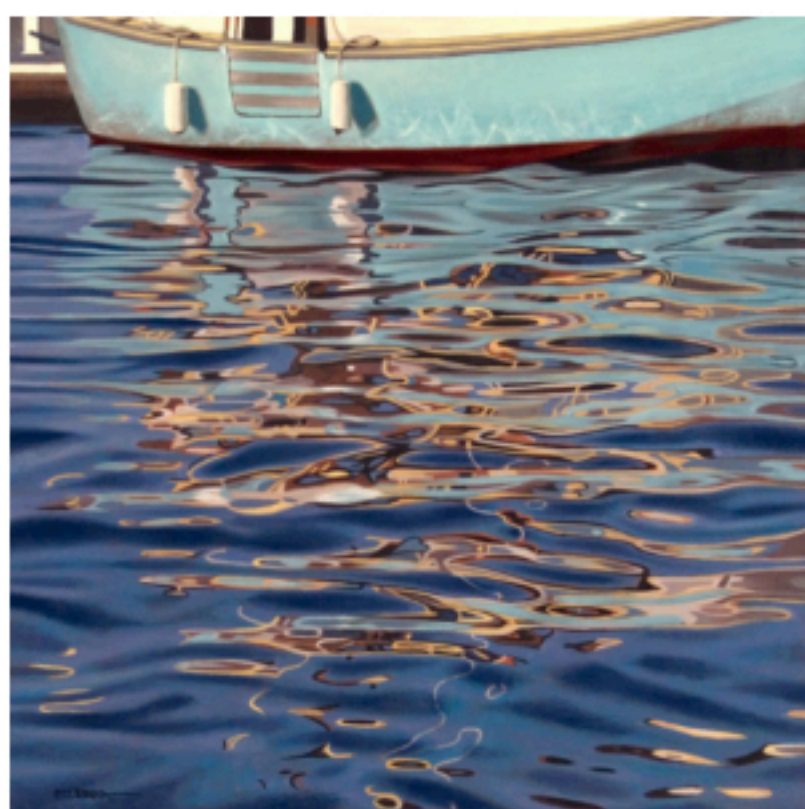
Channel Islands Harbor

In each of these journeys, the vessel she sailed on inspired her to view the bodies of water in exciting new ways, capturing each ocean as an entity, with her work portraying individual portraits of mood and emotion.